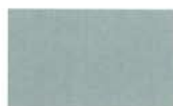
*PRE-WEATHERED GALVALUME ®