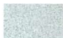
ACRYLIC COATED GALVALUME ®