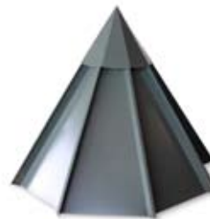
TAPERED PANEL LAYOUT