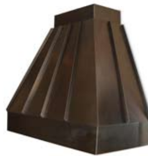
RANGE HOOD GUN-METAL BLUED STEEL