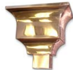
COLLECTOR/LEADER HEAD 20 OUNCE COPPER