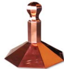
FINIAL 20 OUNCE COPPER